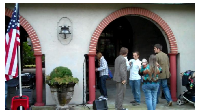
Staff photos 12-12-11