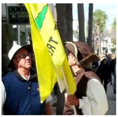
Big Gov Guy